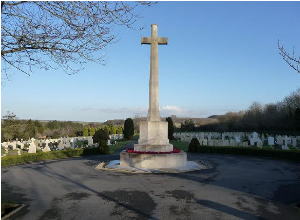
Tidworth Military Cemetery, Wiltshire