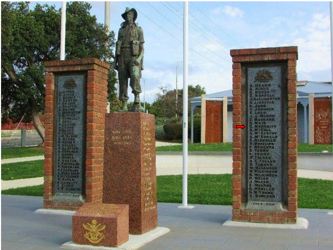
Drouin War Memorial