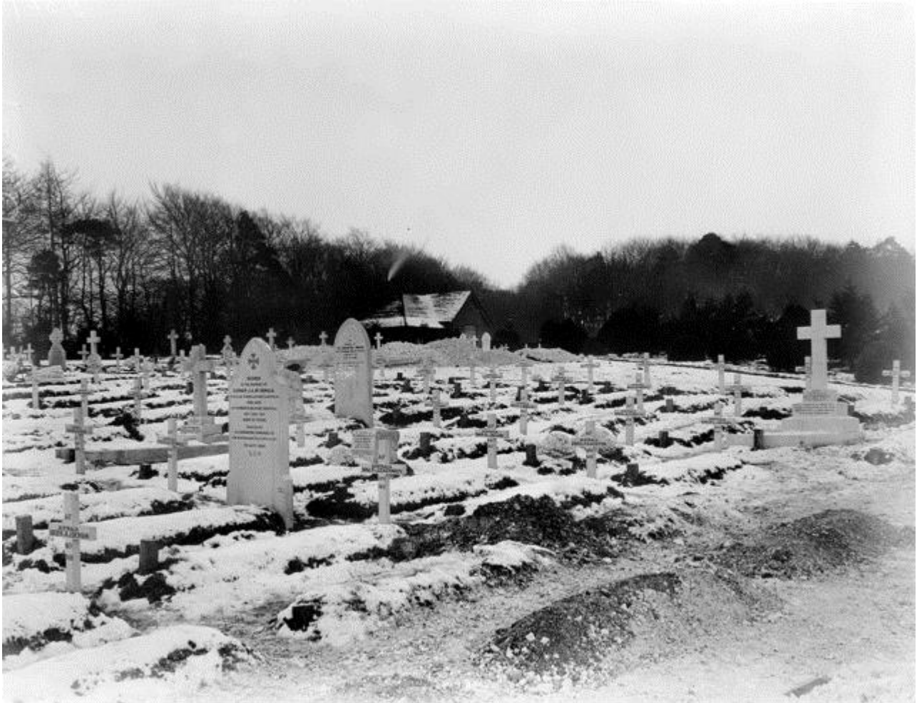
AUSTRALIAN WAR MEMORIAL