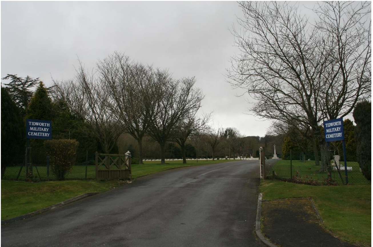
Tidworth Military Cemetery