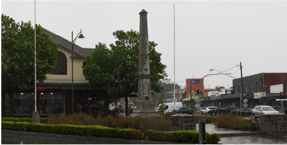
Warragul War Memorial